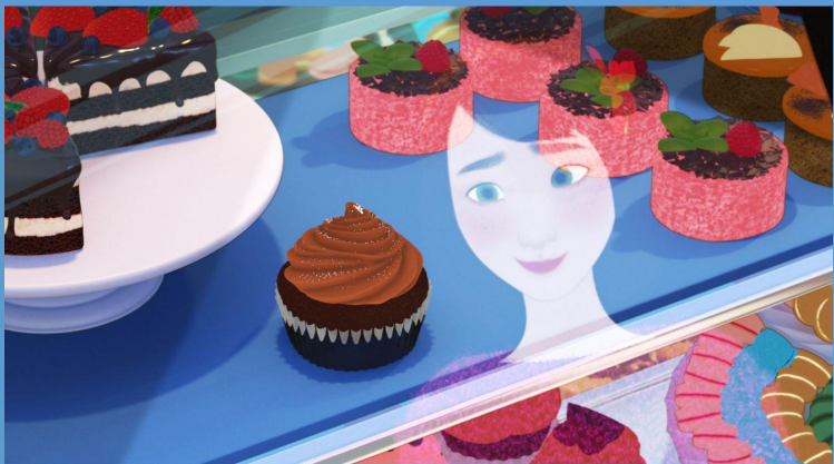
Make room for cake