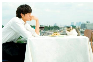
"GOOD COMING -Toru and Neco, Sometimes Cat-" (Japan / 43:39 / Music Short / 2012)

Toru, an Italian chef apprentice who has been washing dishes for an eternity, returns home with a "cat" one night. When he wakes up the next morning, there is a "woman" in its place. Before he knows it, he is helped by the "cat", and becomes a fully-fledged chef.